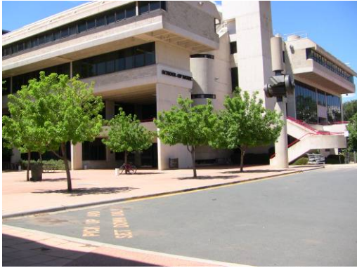
Front of venue access